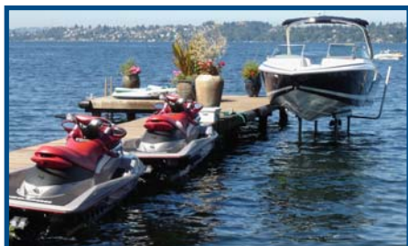
SunLift™, SunLift Mini™ and DockJock™