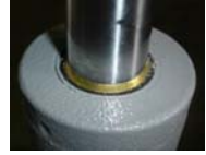
Stainless shaft and bronze scraper seal